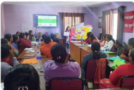
Women stepping up through empowerment training