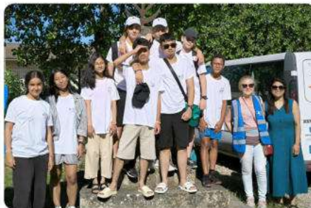
Nepali children explored France during the Olympic Games