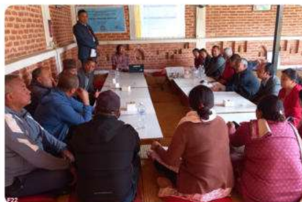
Together for transparency: Social Audit in action