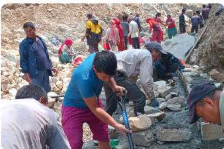
Local communities joined hands to enhance quality water access