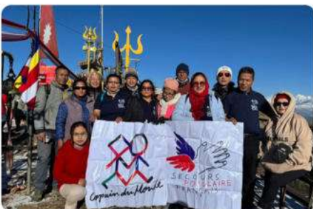
Board members exploring and learning