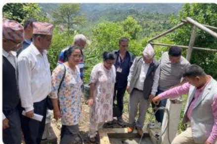
Municipality and UEMS Executive Committee members on a monitoring visit