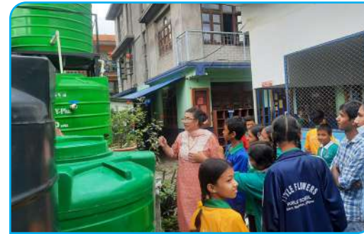
Practically Orientation to students of Little Flower's Public school on Rain Water harvesting and Ground Water Recharging.