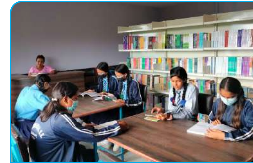
Students are enjoying to read books in Library at Shree Siddhi Mangal Secondary School.