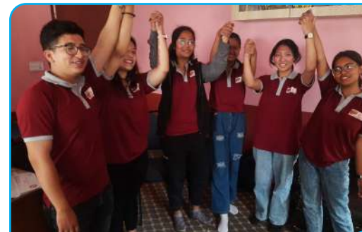
Active CDM Volunteers