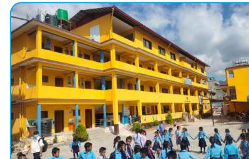
Newly Constructed school building of Shree Siddhi Mangal Secondary School of Mahalaxmi Municipality.