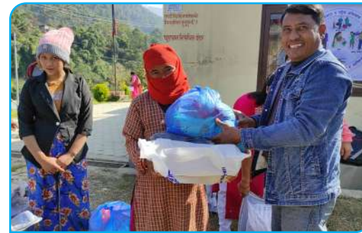
Case support to brick kiln children of Kantipur Ita Udyog at Badikhel under Sakriya Project