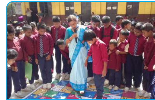
Playing WASH game at Lalit Kalyan School under Cholera campaign.