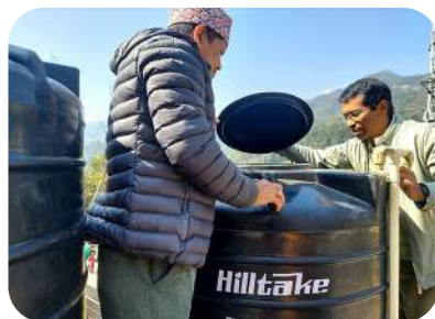
WASH program in Uttargaya Public English Secondary School in Nuwakot