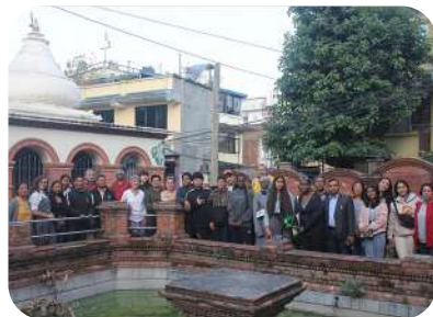
Nepal and France Inter Cultural Exchange Program