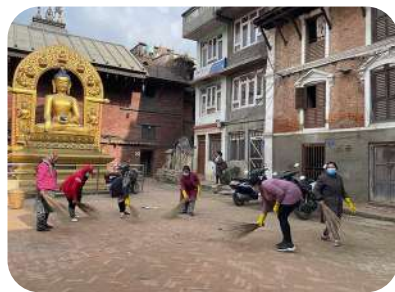
Sanitation Campaign at ward No. 6