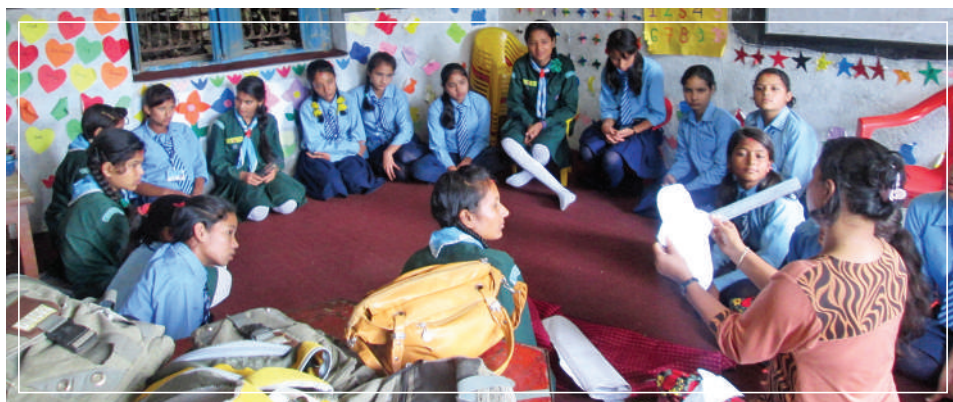
Alternative Learning Center in Nawajyoti School to support education of children in brick kilns.