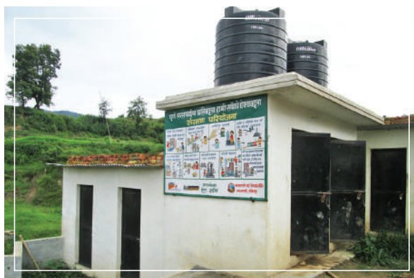
Biogas attached toilet constructed in Santaneshwar Brick Kiln