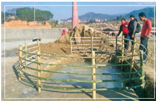
The fencing of a pond in Kantipur Brick Kiln to protect the children from falling inside