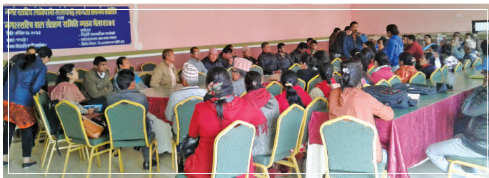
Godawari M-WASH-CC meeting and Formation of MCPC Godawari in 2016