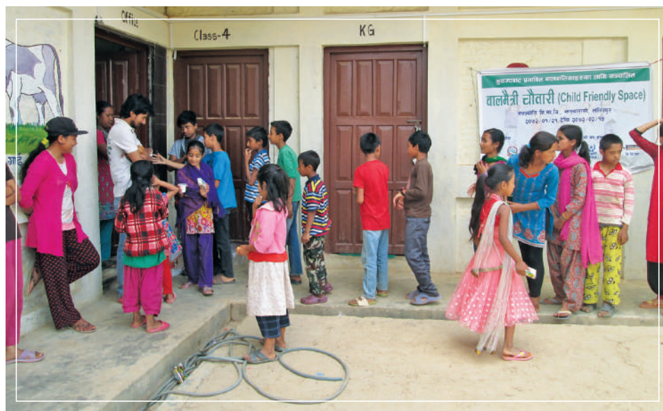
Child Friendly Space at Nawajyoti School for trauma healing of children after the mega earthquake 2015