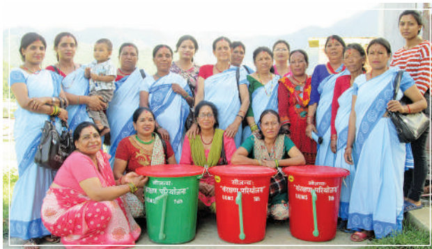
Skill-based Biosand Filter Training and distribution of biosand filters to FCHVs of Jharuwarashi and Badikhel VDCs after the earthquake