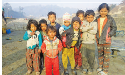
Children residing in Bajrabarahi Brick Kiln

The former Jharuwarashi and Badikhel Village Development Committees (VDCs) of Godawari Municipality, Lalitpur have 10 brick kilns, where thousands of poor and marginalized people from various remote and rural parts of the country come to work for 6-7 months every year to earn a living. According to baseline survey conducted by UEMS in 2013, there are 1942 workers living in 532 Jhyaulis (temporary shelters made of raw bricks for the workers) in 6 brick kilns in Jharuwarashi and Badikhel VDC namely, Bajra Brick Kiln, Bajrabarahi Brick Kiln, Bolbom Brick Kiln, Hanuman Brick Kiln, Kantipur Brick Kiln and Santaneshwor Brick Kiln. Among the workers in the kilns, 17.4% were teenagers, 6% were children from 5 to 10 year age group and 9.17% were children below 5 years. UEMS is conducting different programs and activities on WASH, health and child protection in the brick kilns and host communities under the project. The project duration was 3 years (November 2013 to October 2016), later extended for 8 months till June 2017. The total expenditure of the project was Rs. 40,732,790.48 (Rupees Forty Million Seven Hundred Thirty Two Thousand Seven Hundred Ninety and Forty Eight paisa only).